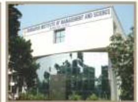
Durgapur Institute of Management and Science, Durgapur