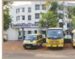
Durgapur Public School Durgapur