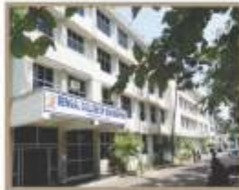
Bengal College of Engineering Durgapur