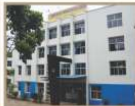
Bengal College of Pharmaceutical Sciences and Research, Durgapur