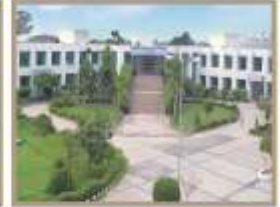
SKS Ayurvedic Medical College and Hospital