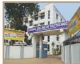
Bengal College of Polytechnic Durgapur