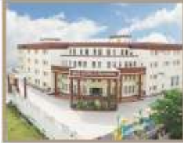
SKS World School Gr. Noida West