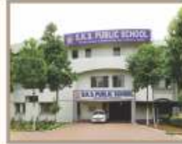
SKS Public School Raniganj