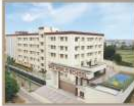
SKS World School HS 4, Noida Extn.