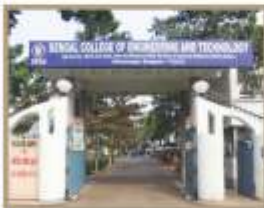
Bengal College of Engineering and Technology, Durgapur